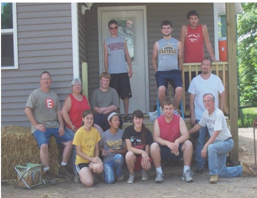
ACTION 2011 Iowa July 5-8 11 years of service to Marquette County

A HUGE thank you to all the individuals, churches, businesses and civic groups that donated over 1,300 lunches this past year. Our program would not work without your continued support!