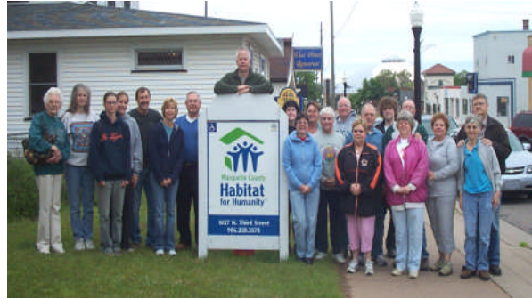
Lawrence Avenue United Methodist Charlotte, MI June 20-24