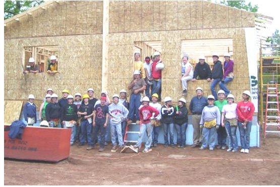
Congregational Church of Amery Amery, Wisconsin June 13-17