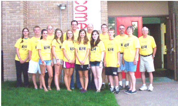
St. John Lutheran Church Oregon, Wisconsin July 25-29