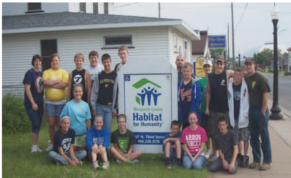
Lakewood United Methodist Lake Odessa, Michigan June 27-30