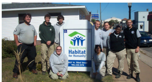
AmeriCorps NCCC Sept 15—Nov 8