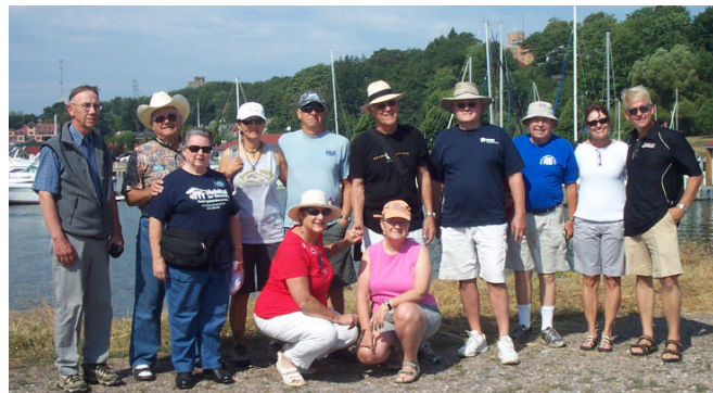
Care-A-Vanners August 22—Sept 2