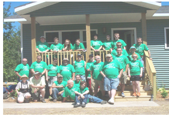
Norway Grove Memorial Lutheran Church Deforest, Wisconsin July 11-14 16 years of service to Marquette County