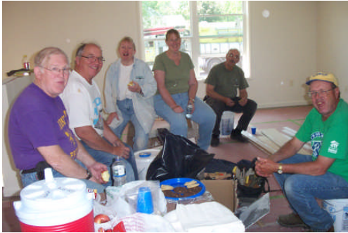
Markesan United Methodist Church Markesan, Wisconsin June 13-17 15 years of service to Marquette