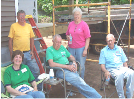
Care-A-Vanners 2011 May 31-June 10